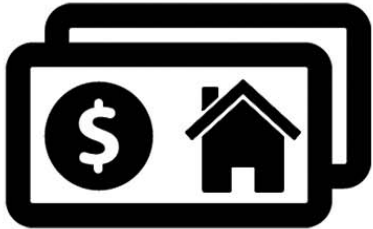
RENTAL ASSISTANCE $733