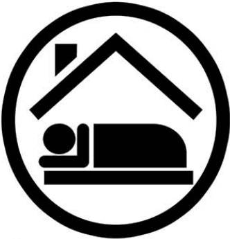
SHELTER BED $570